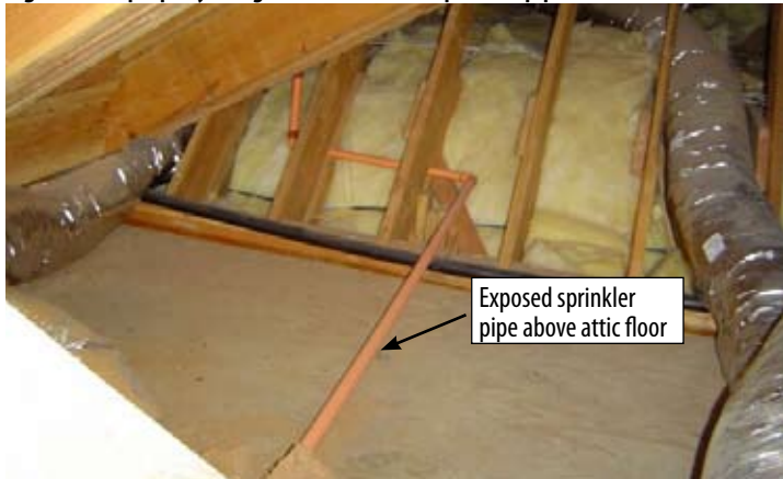
Figure 2 Improperly designed and installed sprinkler pipe in a residence

Extreme caution must be exercised when selecting the option to cover the pipe with insulation. Improperly insulating the pipe can lead to system failure. For example, a sprinkler system within a single-family residence was installed during the summer when little consideration likely was given to freezing. Immediately after the first cooling and warming cycle in the winter, a section of the sprinkler pipe froze and broke, causing significant water damage to the house. The sprinkler system used insulation to protect the pipe from freezing and was designed and installed in a manner that made this method of protection against freezing impossible to properly implement. Figure 2 shows a representative example of the system installation.