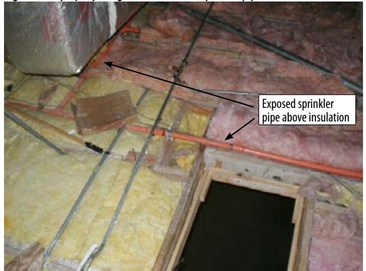
Figure 3 Improperly designed and installed sprinkler pipe in an unheated attic

Another example of an improperly installed system is shown in Figure 3. In this instance, the piping for the upper floor was installed in an unheated attic, perpendicular to and above the ceiling joists. Insulation was layered on top of the pipe to prevent water in the pipe from freezing. Someone walking in the attic stepped on the buried pipe and fractured it, causing water flow and substantial loss. After the system was repaired, the building staff decided to keep the pipe exposed to prevent additional breaks, which now makes the system susceptible to freezing. This system likely will need to be replaced or converted to an antifreeze system in the future.